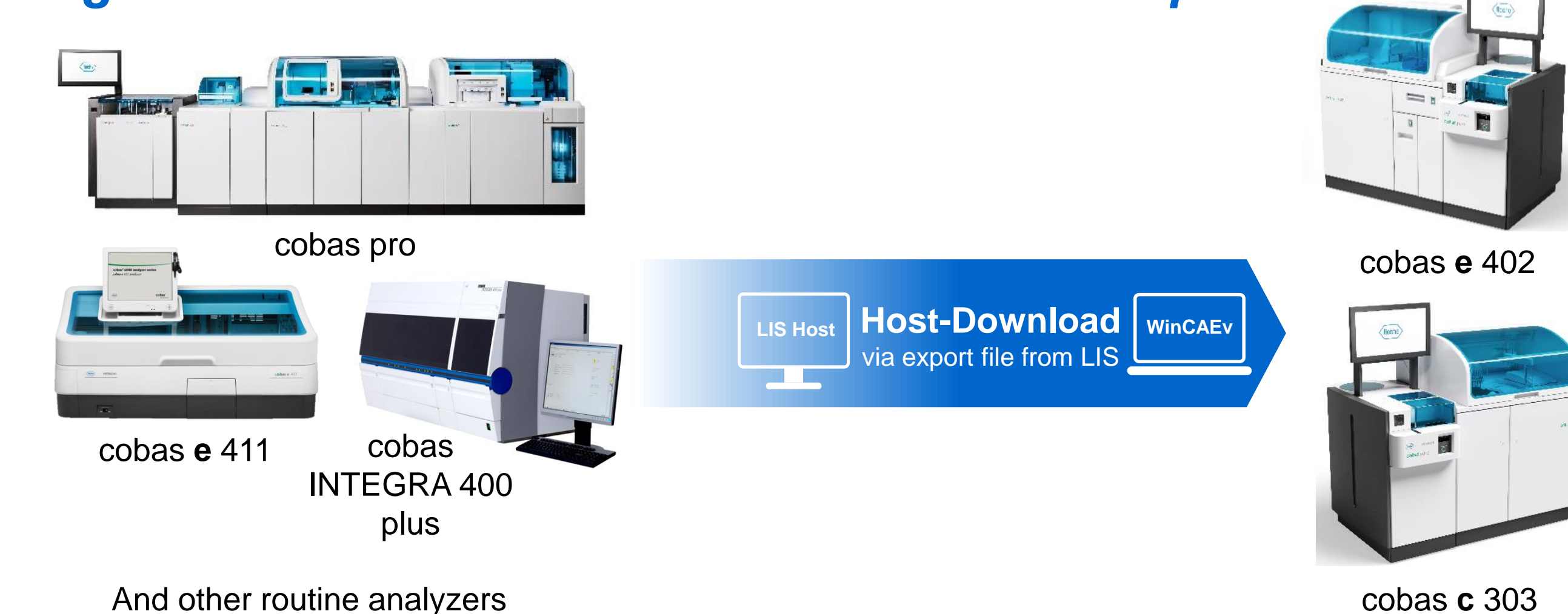
Figure 1. Measurement of routine leftover samples